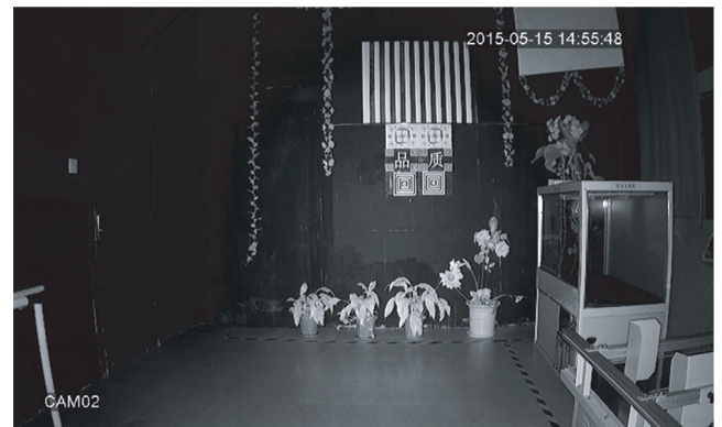
AHD 1.3Mp indoor at night