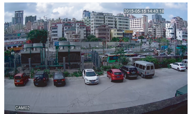
AHD 2.0Mp outdoor in daytime